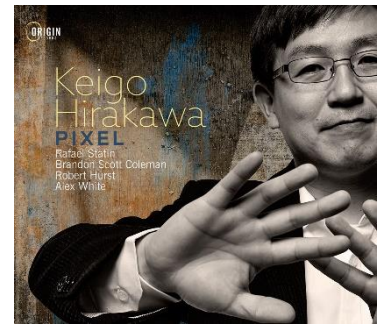
Pixel (Origin Records, 2023)