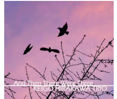
And Then There Were Three (2015)